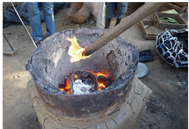
Figure 3: Testing the readiness of the aluminum with a log

The aluminium casting process starts with the collection of scrap aluminium by children from the landfills or outskirts of Lusaka. It is then purchased by foundries where the workers have to sort out and break the aluminium into smaller pieces for melting. While sorting the aluminium the furnace is preheated and the aluminium pieces are put into a crucible for melting. The preparation of the sand mould follows immediately as the aluminium is being heated. Once the moulds are ready, the readiness of the aluminium is tested by dipping a log into the crucible to check if the log catches on fire immediately. The workers then remove the furnace lid with tongs and pours the melted aluminium into the sand moulds. Finally, the moulds are cooled down and disassembled to recover the final product.