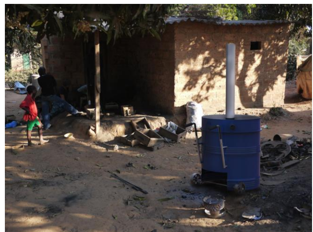
Figure 8: Rendered image of ProTek on foundry site

-Handles: The furnace has been fitted with handles on the sides to allow it to be pushed and pulled. The handles can also be removed during the casting process for allowing more working space for the users.