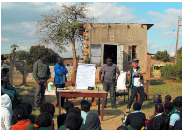
Figure 5: Demonstrating and educating the locals

Therefore we used the prototypes to the community members on how they can learn to cast more safely and efficiently. During the demonstration we also presented other appropriate technologies, which could easily be made and used in the local context. The main purpose of the demonstration was to educate them on how these technologies can offer business opportunities in the local context for better living. In total, we had 4 demonstrations with the prototypes, which started with a small number of community members, but as the sessions went on people would ask us how to make these prototypes and were eager to learn and start their own businesses. The