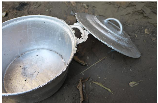
Figure 1: Aluminum pots from the Chazanga foundries

many skilled aluminium metal casters who have been learning and perfecting the skill of melting and casting aluminium for various utensils, which are predominantly cooking pots. These products are produced on demand from the market suppliers and are sold in various marginalized areas in Zambia.