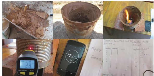
Figure 6: Experiment setup and process

Since heat energy loss was one of the biggest problems for maintaining efficiency and conserving charcoal, we conducted experiments to find alternative local solutions. For better insulation, we conducted an experiment to compare the insulating property between pure clay and additive clay soil, which is a mixture of clay and wood saw dust. The purpose of this experiment was to determine the temperature loss to the body of the heating furnace and comparing the rate of heat transfer to the body in time intervals. The rate of heat transfer across the body of the insulating material is determined by the amount of heat loss to the body of the insulator and the readings of temperature differences at the outer surface of the insulating material. By comparing the temperature from the table, clay soil with saw dust mixture has a better insulating property than pure clay.