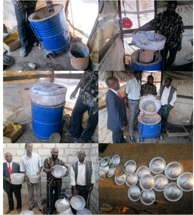
Figure 11: Feedback from the foundry after a month of use

-The ProTek furnace melts aluminium at a higher temperature which makes stronger and smoother products