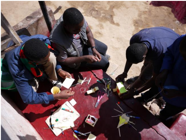
Figure 4: Paper-prototyping to co-create with the workers

Once the problem was framed we started to design simple prototypes to use as a base to engage with the foundry workers and locals. We found that using simple prototypes were more effective in engaging and getting responses from the workers to open up and generate ideas than conducting individual interviews, focus group interviews, and self-documentation methods (photo diary).