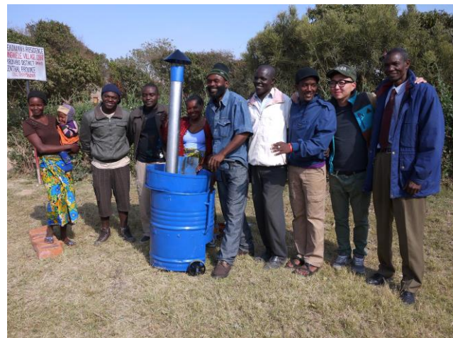
Figure 12: Presenting the ProTek furnace to the workers

The collected feedback was sent to all the team members for further analysis. The feedback is still collected in a 4 week interval and currently the 4 th version of the furnace is being designed and will be made and delivered to Chazanga in Jan 2014.