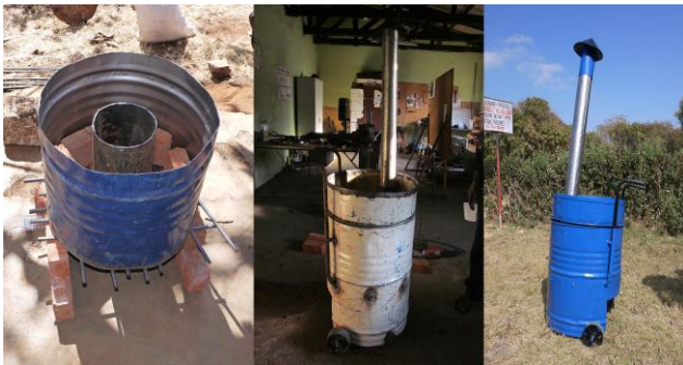
Figure 10: Several versions of the ProTek furnace