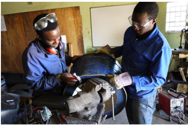
Figure 9: Building ProTek furnace at Disacare workshop

technicians and hardware store owners. The lack of knowledge on the available materials in the market was a time consuming task to find and decide on the type of materials to use. Even though there were certain materials we could get from neighbor countries, we decided to choose locally available materials since it could be manufactured and maintained within the local context. In our point of view, this was a method that can locally sustain the ProTek furnace as well as to offer them opportunities for local entrepreneurship. The construction of the ProTek furnace was performed with the help of a local workshop (Disacare) [4]. Several versions of the ProTek furnace was built and tested with the foundries and modified, which led to our final furnace design.