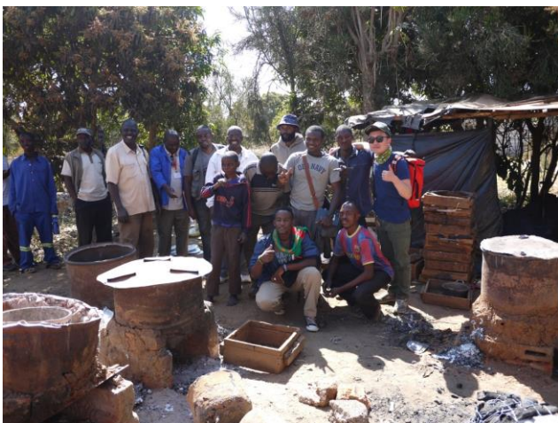
Figure 2: Working with the Chazanga foundry workers

At site we paired into three as a team and concentrated on understanding the context and the needs of the users in order to frame our problem and establish a direction. We started to observe people by shadowing their daily lives and asked problems, questions, and possible solutions as we went along. Unlike previous projects where most of the team members are not local and interpreters are hired and are not directly involved with the project [3], our team was fortunate to have two members who were able to speak and understand the context which gave us a great advantage to communicate and bond with the locals. Also contacting and receiving approval by the head master of the town gave us better access to the local foundries to cooperate with us who were often suspicious regarding outside visitors. Once we were able to work with the local foundries we learned and tried the casting process ourselves to understand the process in depth and to see how we can make improvements. For documentation we used cameras, camcorders and personal journals with the consent of the workers to gather information from the site. The information was later shared with other team members at the end of each day for clarification.