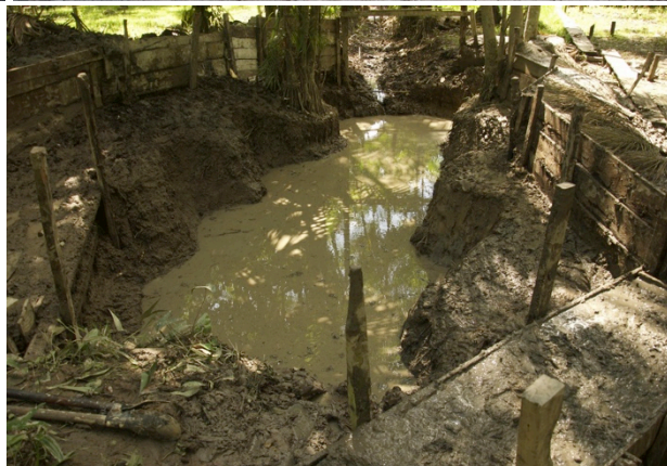
Photos (from left to right): Observing the tide during dry season, digging the pond deeper and with curves, building curved sloping walls made of mud, reinforcing the walls with wood, building a dam to enclose the pond, view of both dams